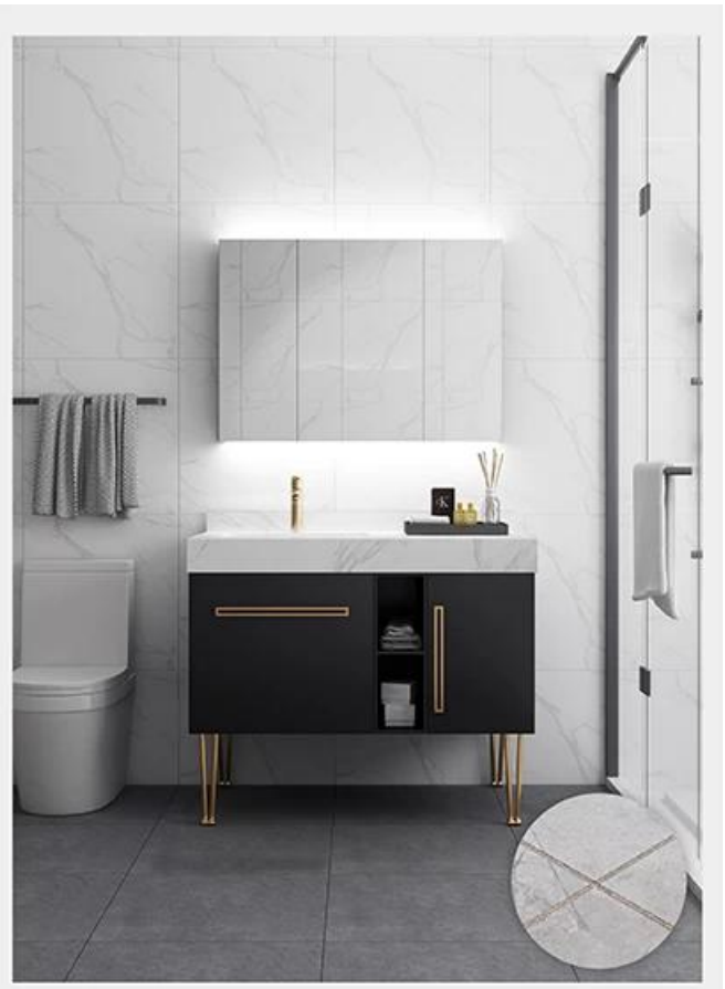
Madaling linisin at mapatakbo